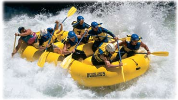
Maytag Rapid – North Fork Yuba

Make Your Reservations Today! Go to www.rivertrip.com or call 1-800-234-RAFT